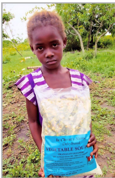
Photo at right: Young girl in Ghana, West Africa with a bag of Okanagan Gleaners soup mix.